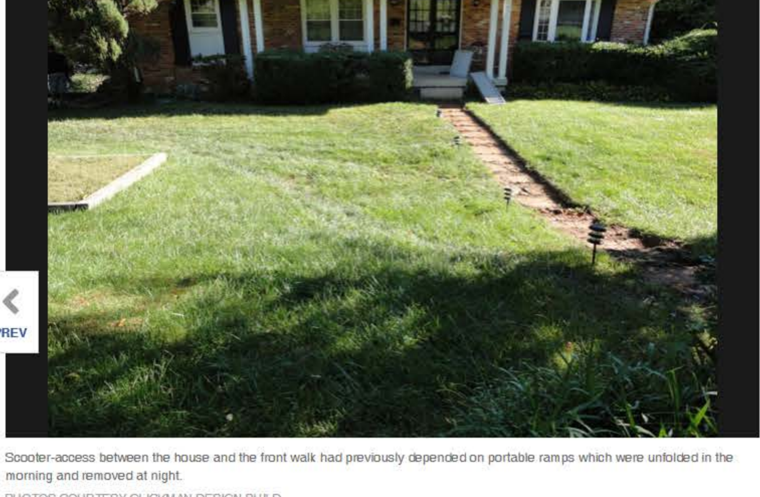
Scooter-access between the house and the front walk had previously depended on portable ramps which were unfolded in the morning and removed at night.

By John Byrd Special to the Fairfax County Times Jul 14, 2016